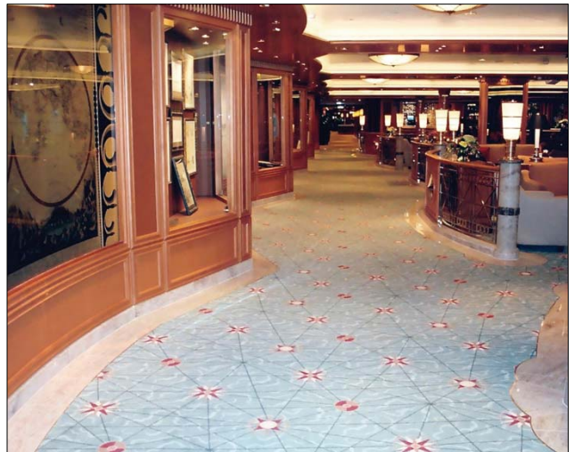
The elegance of the QUEEN VICTORIA is evident in these photos of her main lobby and one of the passageways.