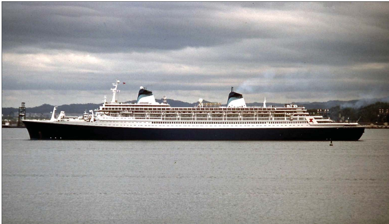
A broadside view of the NORWAY, which as the rebuilt s.s. FRANCE was NCL's industry-changing ship. She was by far the world's largest cruise ship when NCL introduced her to the Caribbean cruise market in June 1980.