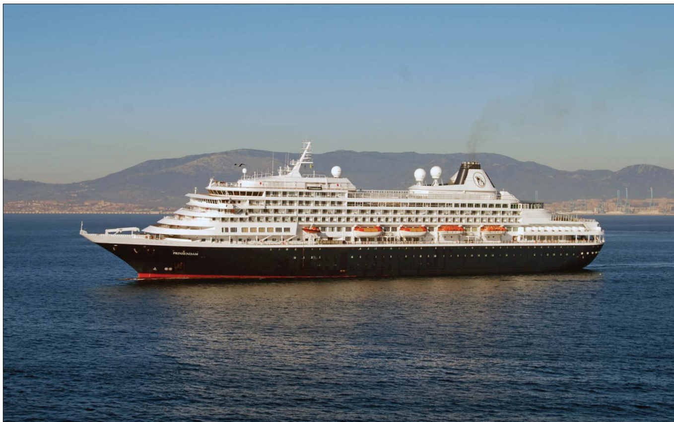
Holland America Line's PRINSENDAM at Gibraltar.