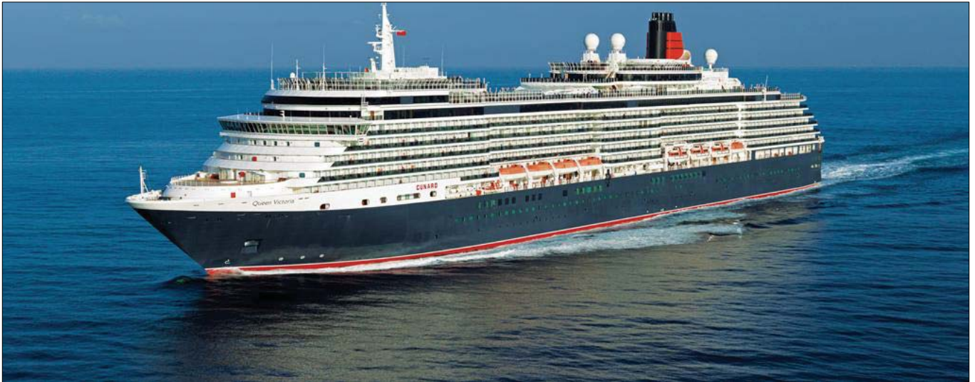
QUEEN VICTORIA of 2007 is a perennial favorite of Cunard passengers. You can join WSS PONY on a cruise around Italy on this luxurious ship next summer. She is renowned for her superb service, ocean liner ambiance, and plush accommodations.